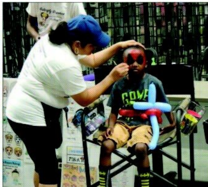
The grand opening for the Dollar General Distribution Center included activities for kids — including facepainting and bounce houses.