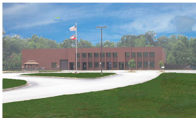
Vernay's Griffin manufacturing facility is located at 804 Greenbelt Parkway.

Established in 1935, Vernay has become synonymous with problem-solving in flow control solutions. With a culture of innovation, Vernay is a trusted provider of flow control solutions for leading OEMs and emerging companies across the Automotive, Medical and Specialty sectors. Vernay's components are integral to daily activities, so you will often hear our team members say, "Vernay Every Day."